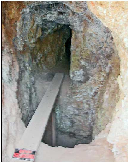
Figure 5. View inside the Copper King No. 1 adit. Plank crosses the vertical shaft, which is caved at 10 feet. View to north.

Here is where mine history comes in. Hardly any of those 1800 mines are still active and a lot of interesting rocks are waiting to be found again. To be clear, not all of the rocks we are interested in were mined commercially. Most crystals, fossils and agates have no mines associated with them. But lots of interesting minerals that were mined have a large variety of other minerals, interesting rock formations, etc., associated with them. So there is a lot of material out there for arm-chair prospectors to look into before heading to the field. A good place to start are the DNR reports on Inactive and Abandoned Mines. There are 78 of them for our area alone. And they are all a couple of clicks away from our website. Under "Helpful Hints" on the website, you can look for the link to the Inactive and Abandoned Mine Report at http://panoramagem.com/?p=457 .