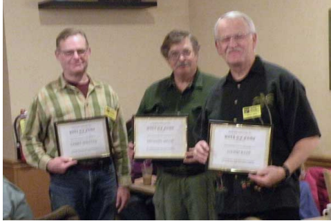
2012 Rock Rollers Hall of Fame